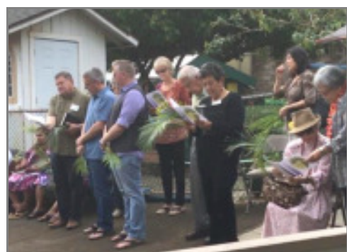
Palm Sunday service began with a gathering song outside in front of the lanai.