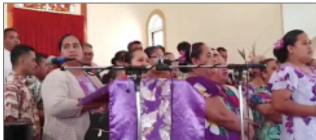
On Palm Sunday, members of the Kona Kosrae Etawi visited with our Kosrae members and sang during the service.