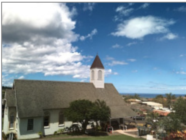
A noonday cloudscape over Wailuku, early April...

Iao United Church of Christ 2371 W. Vineyard Street Wailuku, HI 96793-1626 (808) 244-7353 iaoucc@hawaiiantel.net