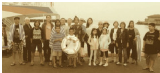
At the Pacific Whale Foundation whalewatch fundraiser on March 24.