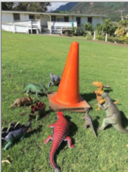
Iao Valley dinosaurs emerging from their lairs to inspect this strange totem on the grounds of the church, in early February.

The lesson in bold is the focus of both the message of the day and any Sunday School lesson; and the italicized title is the theme for the Sunday service. •