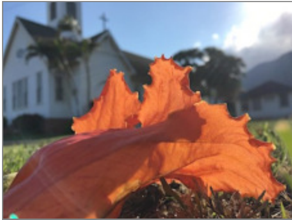
Fallen African tulip blossom near the bell tower...

Iao United Church of Christ 2371 W. Vineyard Street Wailuku, HI 96793-1626 (808) 244-7353 iaoucc@hawaiiantel.net