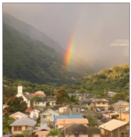
Rainbow above Iao Valley one morning