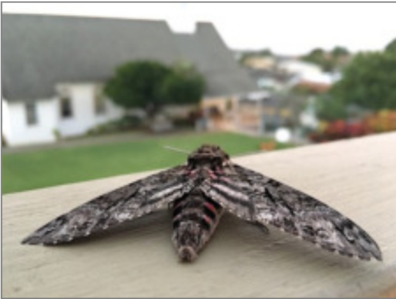
A moth comes to rest on a railing at Fujitomo Hall...

Iao United Church of Christ 2371 W. Vineyard Street Wailuku, HI 96793-1626 (808) 244-7353 iaoucc@hawaiiantel.net