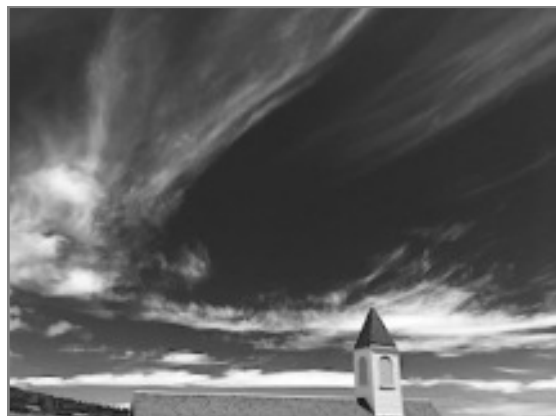
Cloudscape above Iao Church and Wailuku...

Iao United Church of Christ 2371 W. Vineyard Street Wailuku, HI 96793-1626 (808) 244-7353 iaoucc@hawaiiantel.net