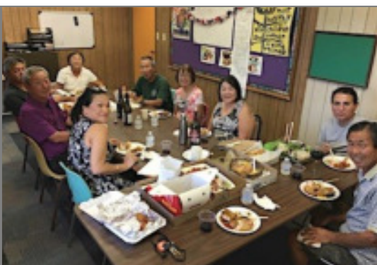
Where the Maui Fair Committee is concerned, meetings are dinner-party-like events. ;-)