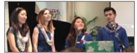
Above: performers at the Hiroshima-Nagasaki Remembrance Day event hosted by Iao UCC on Sunday, Aug. 2nd.