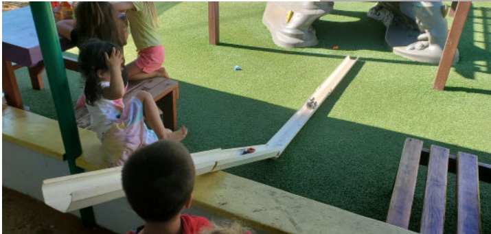
Trucks and ramps

Once again the family homework decorated the sanctuary at Christmas time.