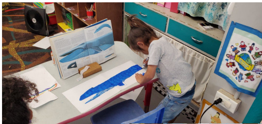
Ocean creatures creations