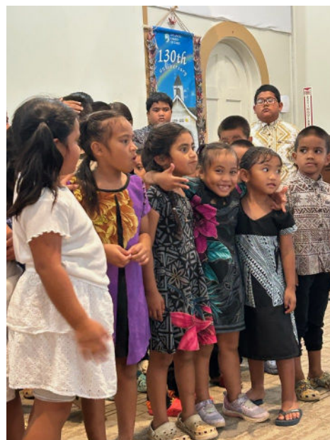
Kosraean children share a song!