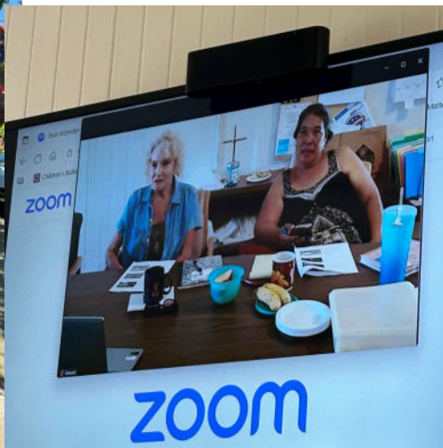
Church Safety Zoom conference