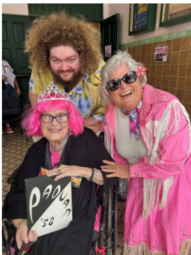
Seen at 'Īao Theatre ...